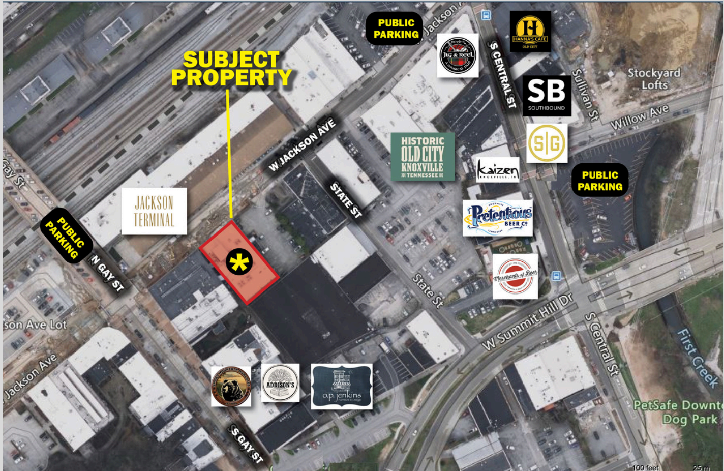
Aerial View with Map